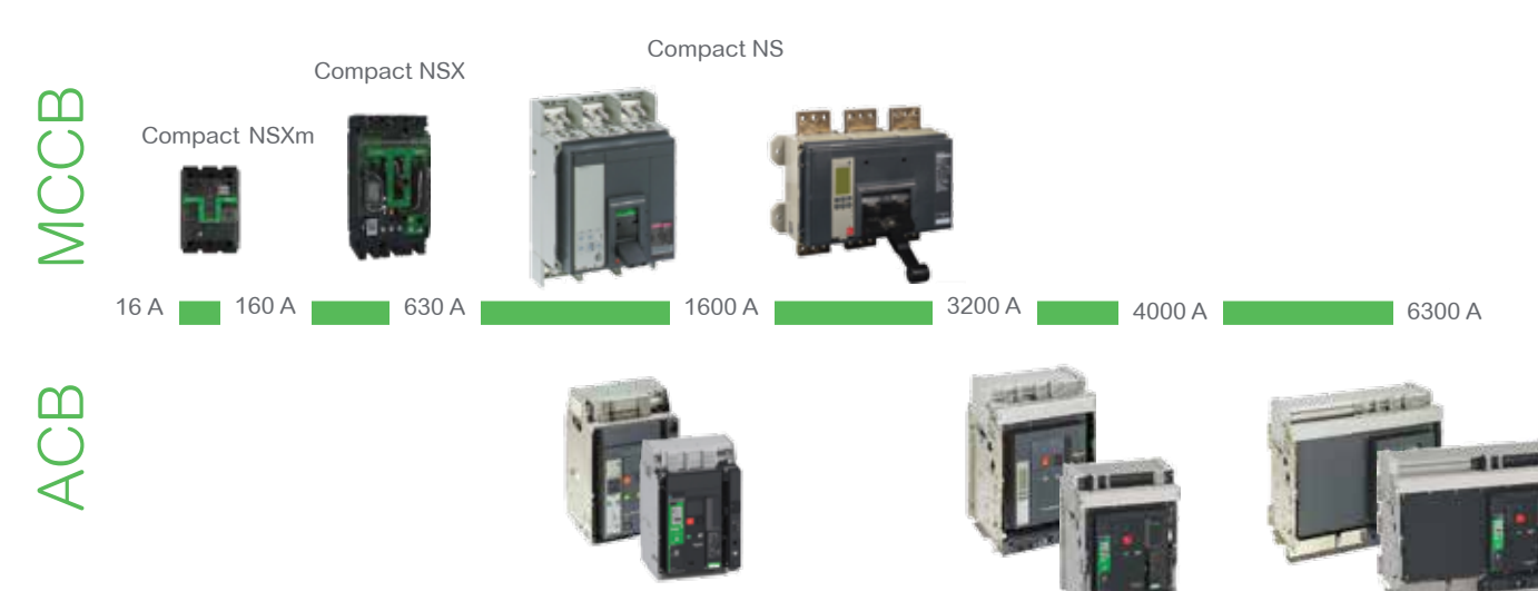
MasterPact NT & NW